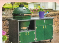
20% Off Grill Cabinets