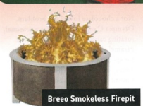
Breeo Smokeless Firepit