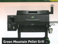
Green Mountain Pellet Grill

Kamado Joe grill package includes charcoal, starter block & gel, ash tool & cart.