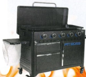
Pit Boss Gas Griddle 5 Burner