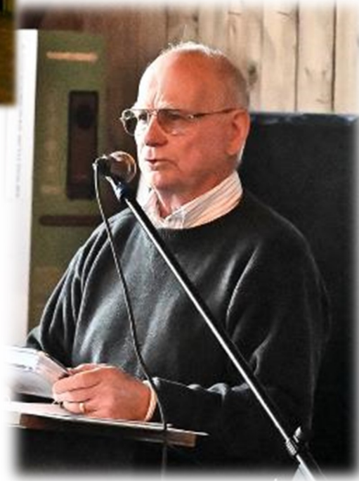
We want to thank The Barns at Nappanee - Stutzman Steak House for Hosting!