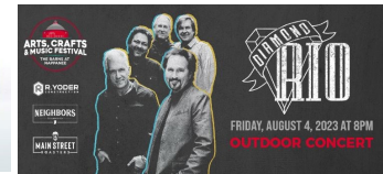
FRIDAY, AUGUST 4, 2023 AT 8PM OUTDOOR CONCERT